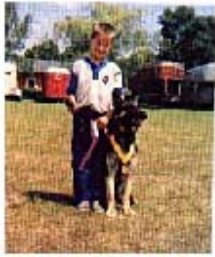
10 yrs old