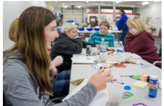
Playing PORTL –

On Sunday, we dove into the science of behavior by playing a game called PORTL. We also did some playacting in order to practice listening skills.