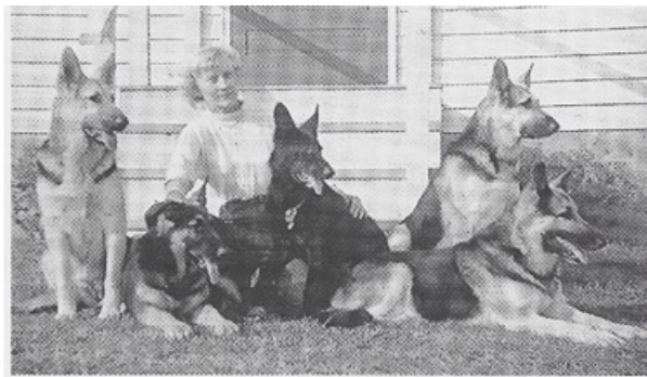
The family poses together in 1957. From left to right: Canadian Champion, Kemarok Robin of Cheyenne, International CDX; Canadian Champion, Kemarok Sunset Jubilee, American and Canadian CD; the author, Kemarok Twilight Kaper CD; Canadian Champion, Lance of Kemarok, International CDX, Kielja of Long-worth.